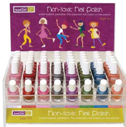
Counter top display with free testers, 11 3/4" x 8" x 9"

The first nail polish remover gel, a one-of-a-kind product made from corn and soy, this gentle gel is earth-friendly, vegan, odorless, nontoxic, nondrying to the nails. Works with all nail polishes, water-based and conventional.