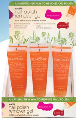
POP display, 5" x 6" x 8"