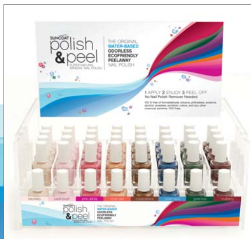
Counter top display with free testers, 11 3/4" x 8" x 9" (H)

The first water-based, odorless, eco-friendly, peelaway polish featuring natural colors and mineral pigments instead of synthetics. 8 stylish colors to choose from. No nail polish remover needed. Apply. Enjoy. Peel Off.